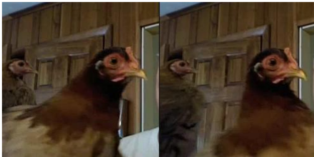
Figure 1: Relative to the world, the chicken's head appears to remain in place as its body moves forward [Sandlin 2008].

If there is any relative movement between subject and camera during the imaging formation process, the resulting image will be motion blurred. There are many different ways to reduce or eliminate motion blur, each with its own set of complexities and tradeoffs. The simplest way to avoid blur is to prevent camera motion by using a tripod, but if motion is unavoidable, like in a car or an airplane, more sophisticated techniques must be used to compensate for camera motion. We propose a novel method of forward motion compensation involving backward moving cameras that cancel the effects of vehicle motion. This approach is useful when the scene to be captured has large depth range, but its reliance on accurate moving parts means it is not the best choice for simpler motion blur situations.