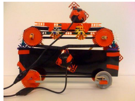
Figure 3: Rear view of the prototype

As the vehicle moves, the top camera is motion-cancelled, and the bottom webcam moves twice as fast. As the chain turns, the cameras move horizontally and then switch sides. In order to always output from the non-moving camera, there is black mask on the lower half of the vehicle, blocking the current lower camera from seeing anything. The software is programmed to choose the camera input that is not blacked out.